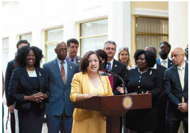
We celebrated Juneteenth at the Capitol with spoken poetry and speakers. It was so powerful!