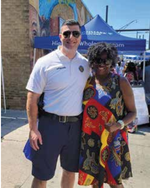
Southwest Community Day with 12th Police District.