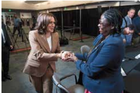
I had the honor to meet Vice President Kamala Harris!