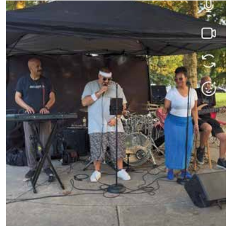
Everyone was dancing at Jazz in the Park!