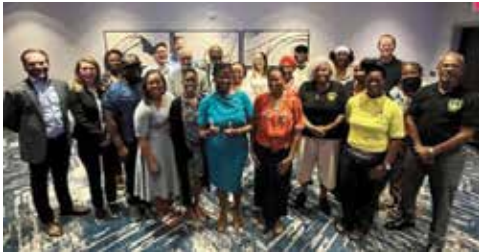
Development Leadership Meet & Greet at Navy Yard.